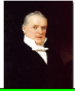
15 th President of the United States James Buchanan